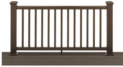
Rail & Square Composite Baluster Kit