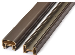
Crown top rail and Universal top/bottom rail