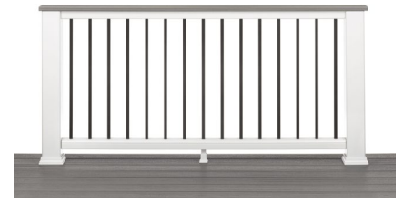
Cocktail Rail & Round Aluminum Baluster Kit