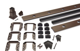
Infill kits: baluster spacers, foot block, mounting hardware