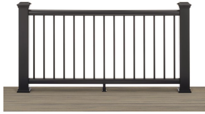
Rail & Round Aluminum Baluster Kit