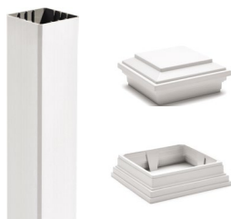
Post components: post sleeve, cap, skirt