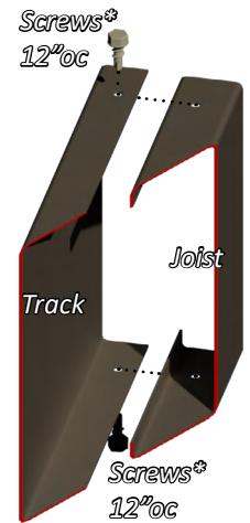
Exploded Stringer Components