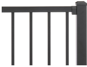
Aluminum Rail & Square Baluster Kit