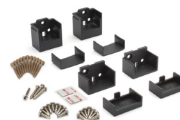
Mounting and support hardware