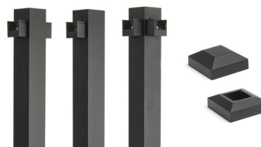
Aluminum posts with premounted brackets, cap and skirt