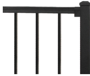
Aluminum Rail & Round Baluster Kit