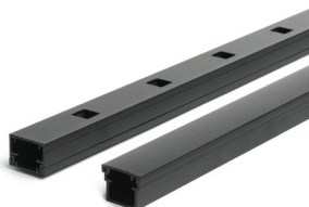
Aluminum top and bottom rail