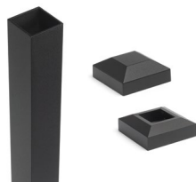
Aluminum post with cap and skirt