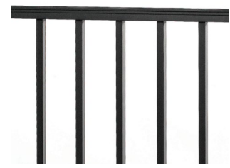
Aluminum Assembled Square Baluster Panel