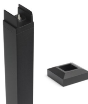
Aluminum crossover post with skirt